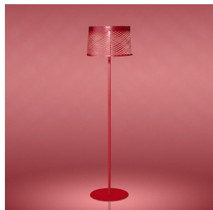
Twiggy Grid Lettura